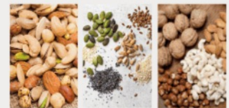
Nuts & Seeds