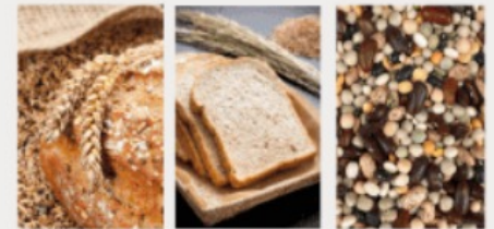
Grains & Legumes