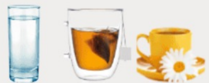
Water & Tea